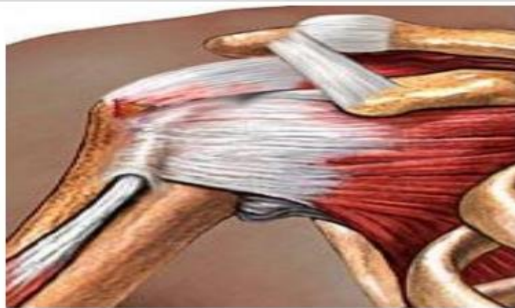
Рис. 3. Повреждения вращательной манжеты плеча

Also among various injuries, tendinitis stands out. This is an inflammation of the tendons that surround the shoulder joint. This inflammation occurs as a result of friction between tendons and bones. In some cases, simple biceps tendonitis may occur - this is an inflammation of the inner part of the shoulder up to the elbow area. Upon palpation and movement, the athlete will feel sharp pain in the shoulder area. Rotator cuff injuries are a fairly common injury in volleyball. In addition to the rotator cuff tendons, the supraspinatus "outlet" includes the subacromial bursa and is bordered above by the medial and coracoacromial ligament. If these structures are damaged or swollen, a "pinching syndrome" (impingement syndrome) may occur in this area, which will be secondary to these injuries. If there is swelling or muscle hypertrophy in the supraspinatus "exit" in an athlete, subsequent repetition of movements above the head leads to increased swelling and the development of reactive inflammation. This can lead to bone impingement, and continuous repetition can cause a rotator cuff tear. The supraspinatus tendon is most often damaged, as it is located between the humerus and the acromion of the scapula (Fig. 3).